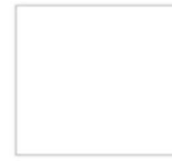
M1 - White