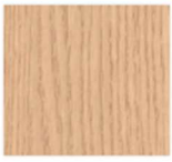
D1 - Whitened oak