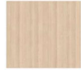
D3 - Sand Ash