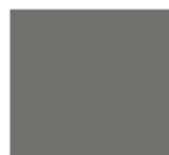
H17 - Grey