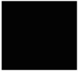
J4 - Black