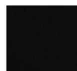
W3 - Ash stained black