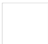
E - White