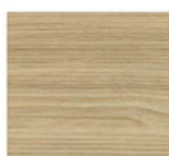
W2 - Ash stained light grey