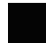
A - Black