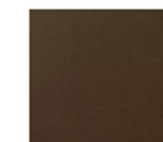
S1 - Deep bronze