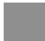
M - Metallic