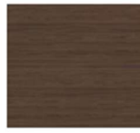
D4 - Dark walnut