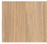
D2 - Amber oak