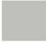
N3 - Pearl grey