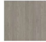
D5 - Grey wood