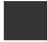
N1 - Dark grey